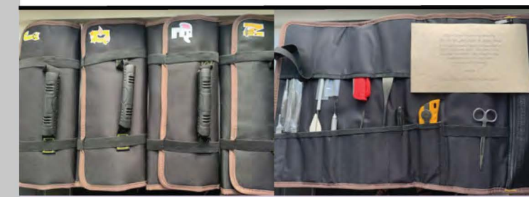
Above: The 1st year students were given their tools in a canvas case for easy transport filled with tools they will use throughout their studies and careers.

The department is happy to be participating in Buffalo State's Day of Giving this year for the third time. The fundraising event will be held entirely online for 24 hours from noon on Wednesday, March 16th to noon on Thursday, March 17th. The challenge is to see how much can be raised in a short, 24 hour period. We are raising funds to help our students with graduate fellowships as this is our greatest need. Please watch our department Facebook page and your email for more information in the coming months. Many thanks to those of you that have participated in this fundraiser in the past and we appreciate your continued support!