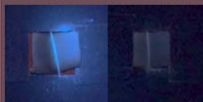
D2 and D3, UVC induced fluorescence, before and after