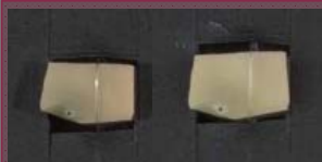
B1, salicylic acid, before and after