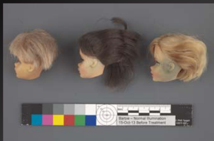
The Barbie™ head on the right has extreme "green ear syndrome" from wearing metal earrings. Below, UVC induced illumination displays the area and penetration of the stain