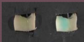
D4, benzyl peroxide before and after

Salicylic acid treated samples displayed nominal visible difference in normal illumination (top left). The benzoyl peroxide samples had diminished stains, but also loss in material color, a result noted in amateur use and common from bleaching agents (top and bottom right). Sample D4 demonstrates a change in stain color. In UVA-induced illumination the samples had minor fluorescence, while in UVC, the salicylic acid treatment had significant fluorescence, most likely due to dyes present in the acne gel (bottom left).