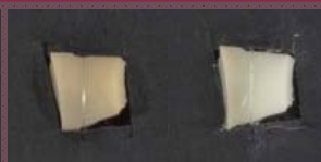
B4, benzyl peroxide, before and after