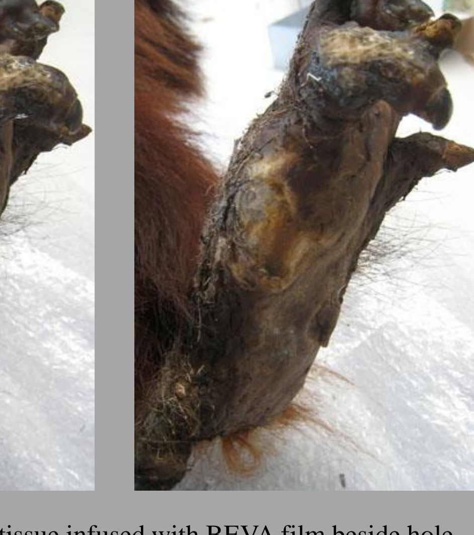
Left: Circular toned fill tissue infused with BEVA film beside hole in proper left foot. Right: Toned tissue applied to exposed BEVA where original rubber no longer aligned and in-painted.