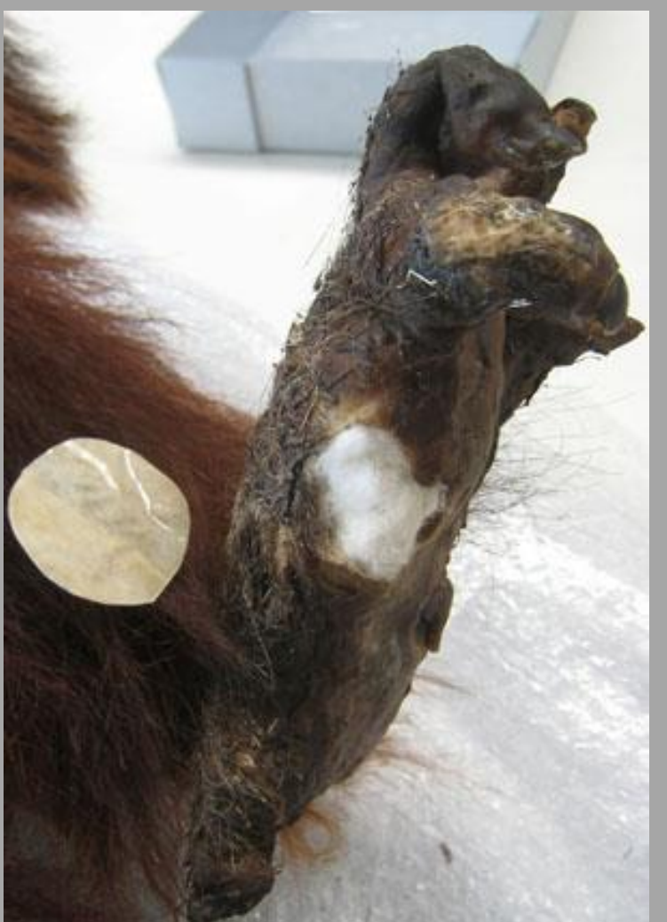
Left: Proper left hand Right: Proper right hand (detached fingers recovered but not pictured).