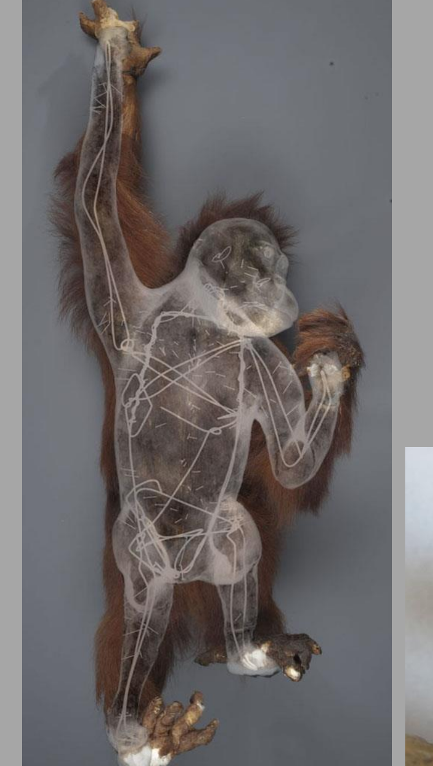
Above: X-radiograph superimposed on normal illumination photograph.

Response: The specimen was removed from the display mount by prying out nails and collecting broken finger fragments. Running ATR-FTIR on skin samples confirmed that the taxidermist replaced the palm skin and pads of feet with latex rubber. X-radiography revealed the internal support.