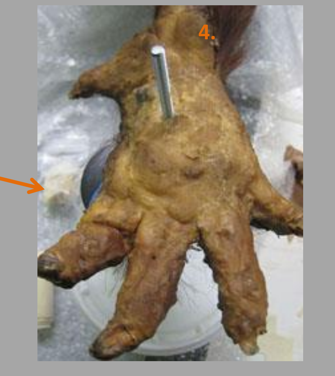
1. The batting was removed from the proper right hand and a hole drilled into the plaster. 2. An epoxy-coated wooden peg with threaded metal rod inserted into drilled hole. 3. Palm reconstructed/reinforced with lightweight spackle. 4. Fingers reattached.

Mounting Response, cont.: A new display support mount was constructed from a prefabricated polyester resin branch and by casting additional epoxy branches to fit the specimen's limbs. The threaded rods from the specimens were inserted into the new mount (see photo below), secured with nuts, covered with lightweight spackle, painted, and documented in an X-radiograph (see photo to the right)