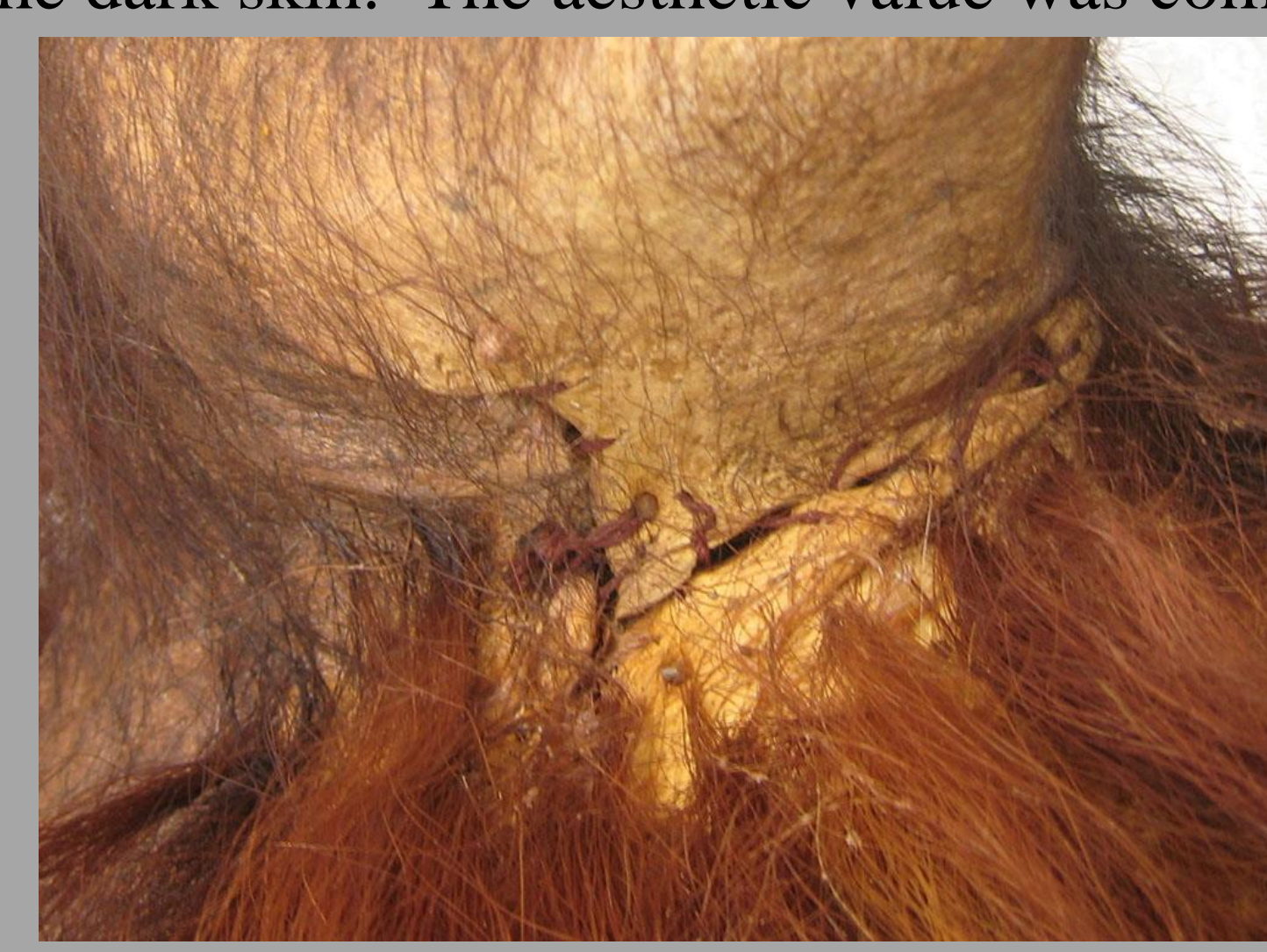
Before Treatment under the chin seam.

Seam and Loss Repair: The amateur taxidermist mounted the orangutan with misaligned hide and wide, obvious seams. There were areas of skin loss throughout, present as lighter areas in the dark skin. The aesthetic value was compromised.