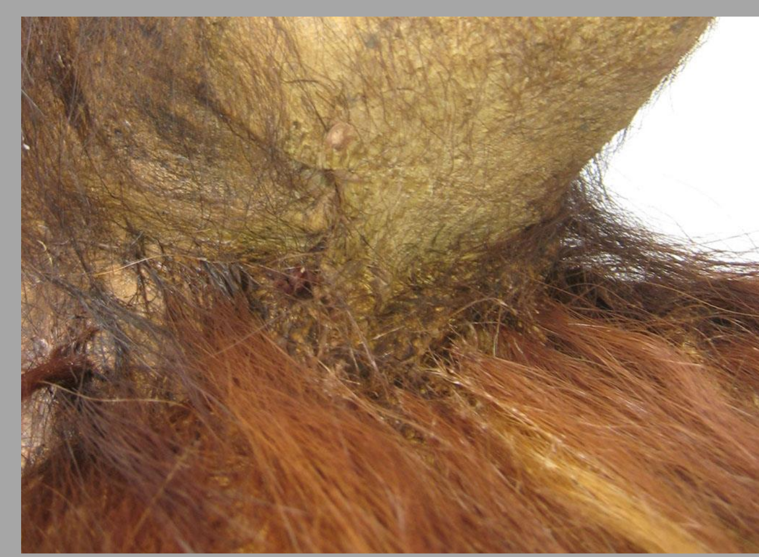
Corresponding After Treatment from toned fills and in-painting

Response: Toned Japanese tissue was applied using BEVA film or wheat starch paste throughout the specimen, as well as in-painting, for visual compensations.