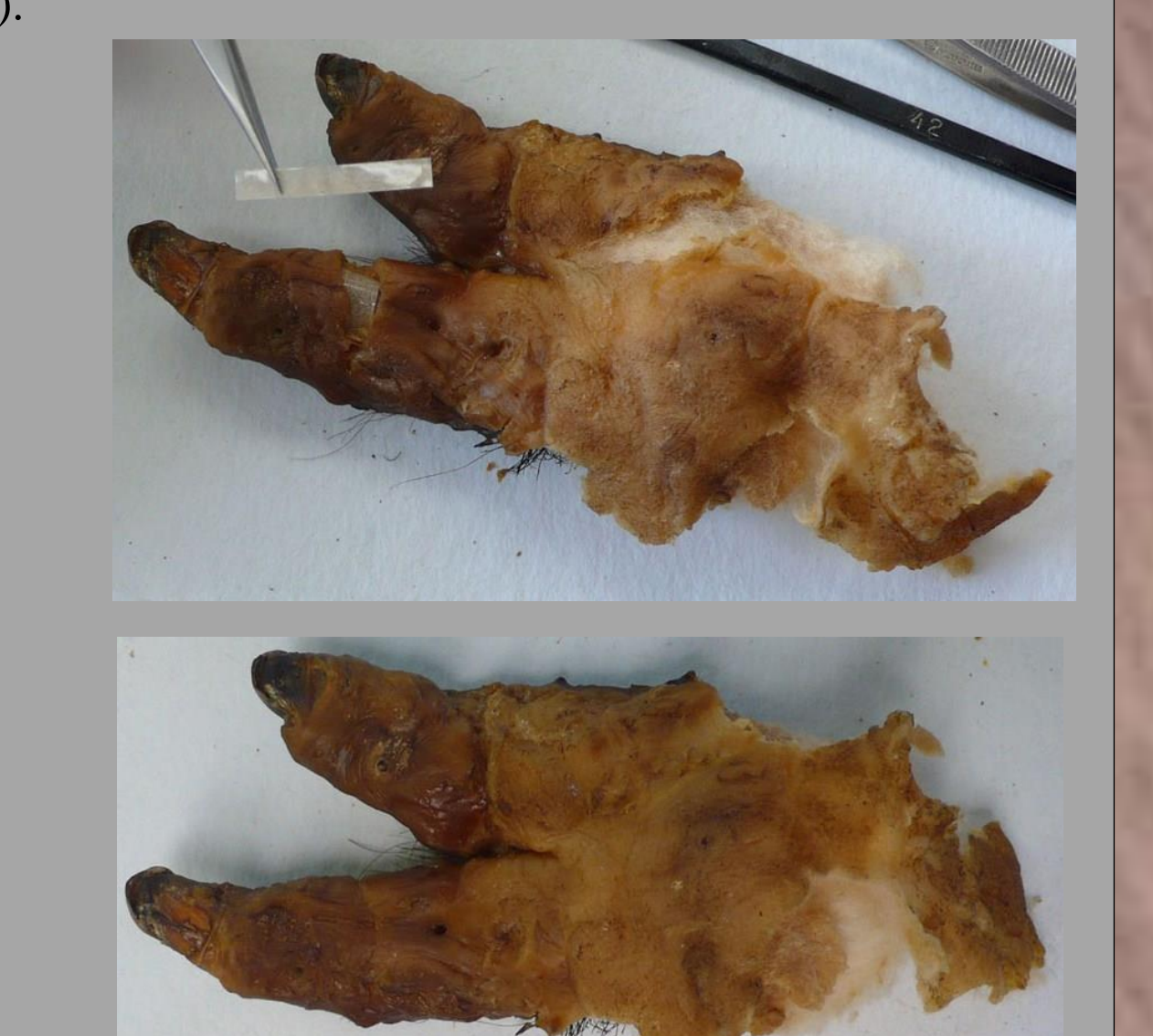
Above: Lining the interior of splits with toned tissue infused with BEVA. Below: After setting the linings using heat.

Repairing Mount: The specimen needed a new display mount that could support it without further damaging the deteriorating latex rubber.