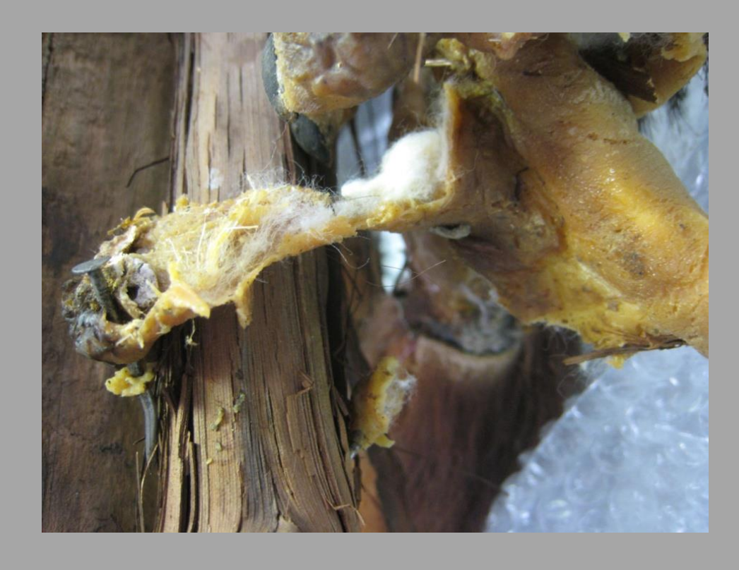
Left: Specimen on original driftwood display mount; Right: Proper left hand torn and pulling from mount.