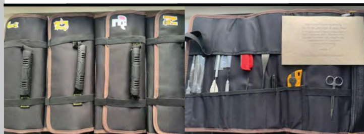
Above: The 1st year students were given their tools in a canvas case for easy transport filled with tools they will use throughout their studies and careers.

The department is happy to be participating in Buffalo State's Day of Giving this year for the third time. The fundraising event will be held entirely online for 24 hours from noon on Wednesday, March 16th to noon on Thursday, March 17th. The challenge is to see how much can be raised in a short, 24 hour period. We are raising funds to help our students with graduate fellowships as this is our greatest need. Please watch our department Facebook page and your email for more information in the coming months. Many thanks to those of you that have participated in this fundraiser in the past and we appreciate your continued support!